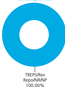
% Rating Profile